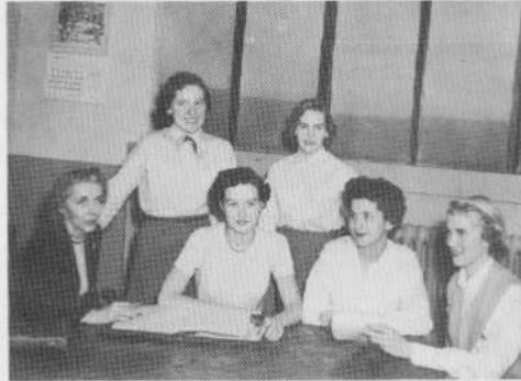
Picture Scheduling Committee