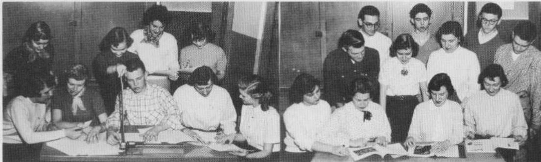
Snap Shot Committee